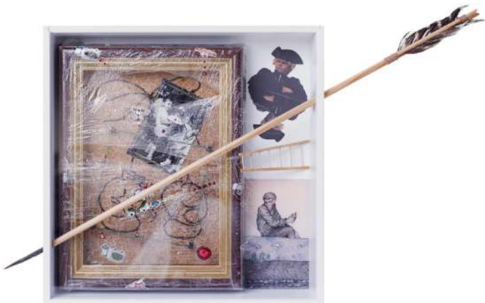
Krasimir Dobrev (1962)