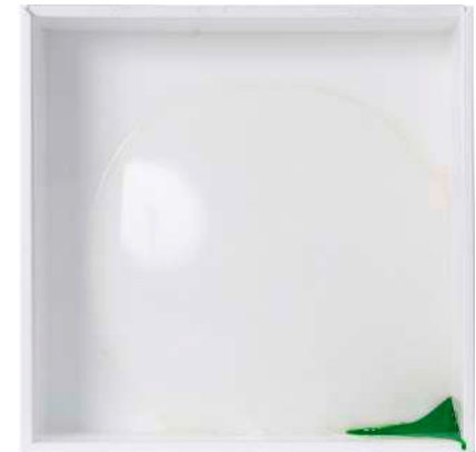
Takesada Matsutani (1937)

Modernity is subordinated to the digital image, to existence with the idea of universal accessibility to the virtual collections of fragments of being. Everything is conceivable here and now, it can be traced back to the global communications networks, but that does not make us more confident in structuring the future. The illusory accessibility of information is in fact limited to the technical parameters of the internet search engines, while the visual puzzle we live in includes details of a various nature and to assemble the wider picture turns out to be a rare and hard-to-achieve talent. The personal rituals of collecting strange objects and pieces of nature, associated with important memories and emotions, no longer correspond to today’s fast-paced existence. Visual details from the picture of someone’s success, sudden insight, emotional collapse or rise, our unique personal stories – are stored in the database of our mobile devices.