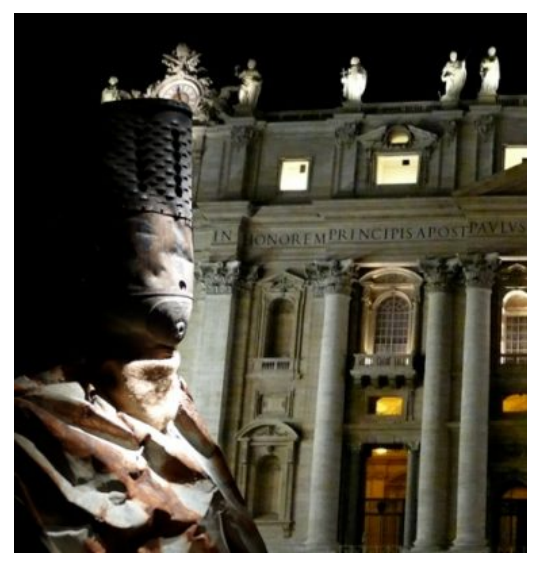
Rodolfo Lacquaniti moves in re-utilizing objects, scraps and garbage that he reassembles to become universal art.