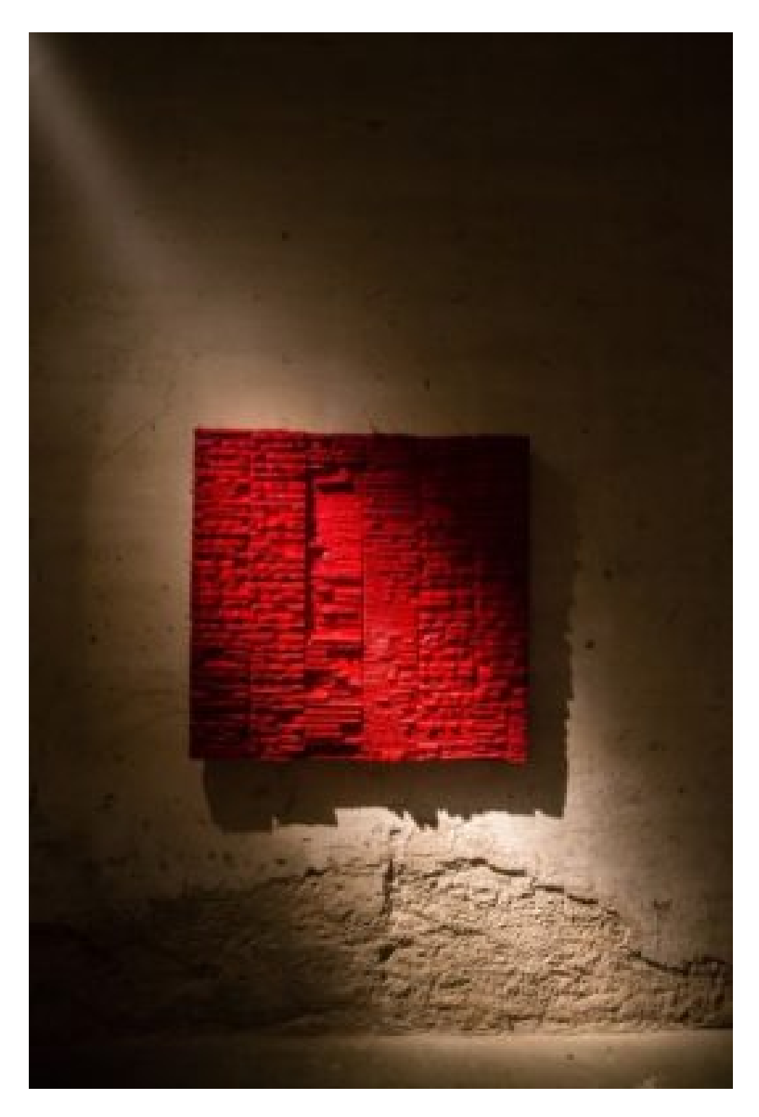
The Garbage Revolution is the revolution of a society made of nearly a hundred H202 mutants. Each one has a personal code that registers circumstances, meetings, relations and influences that each scrap has had with the artist and the world that generated him.